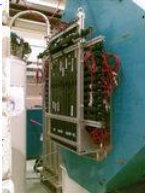
Preliminary installation before Q7 (July 08)