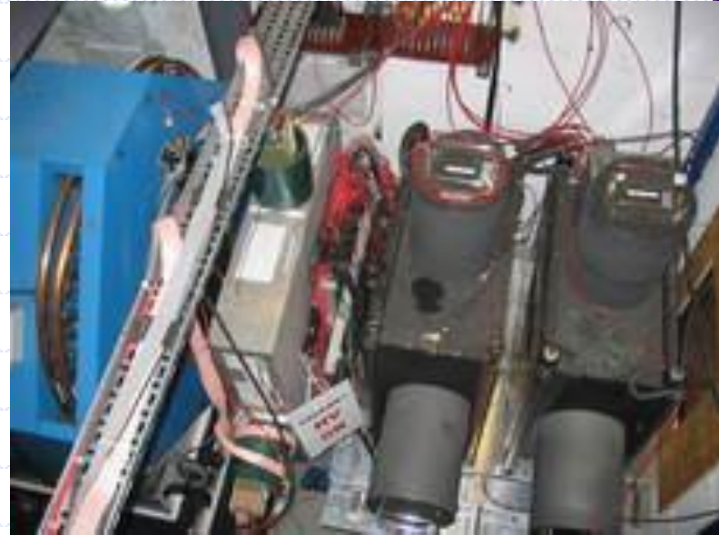
Installation in final position inside DSA